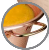
Steel pot handles