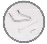
Removable blade and motor for ease of cleaning