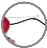
Safety cable holder