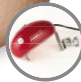
Compact motor unit