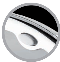
LED lighted switch