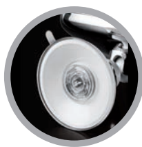
Strong suction cup secure mounting