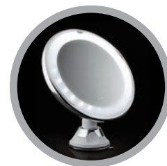
Horizontal plane mounting