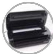
Roll holder with cutter