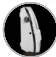
Vertical space-saving position