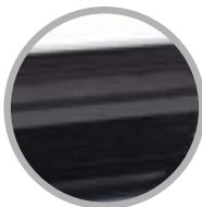
Double size sealing bar