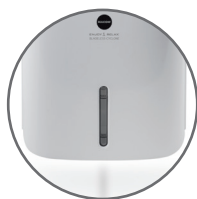
Water level indicator