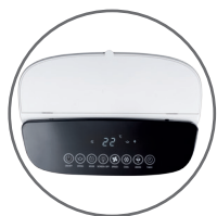
Touch control panel